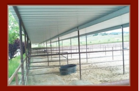
Clockwise from top left: Residence, Large Pasture, Panoramic View, Tack Shed, front entrance and 30 spacious corrals