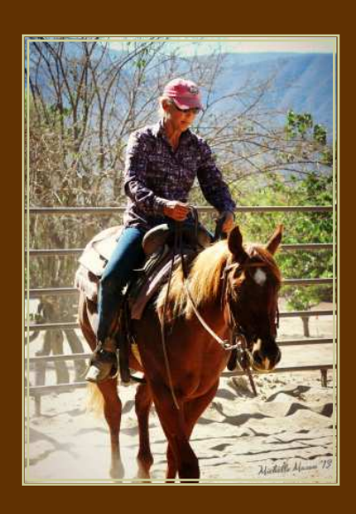
Keepers first ride